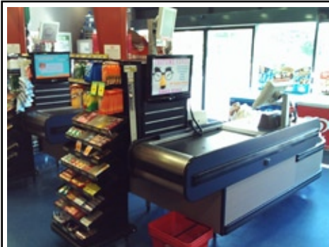
Duggans IGA - Maroochydore 3 screens - 10,000 people per week