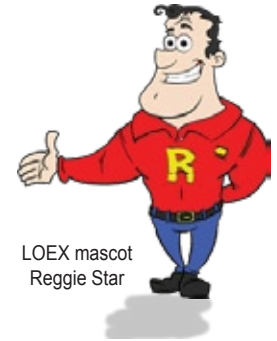
LOEX mascot Reggie Star

Once the store slide limit is reached, a waiting list is available.