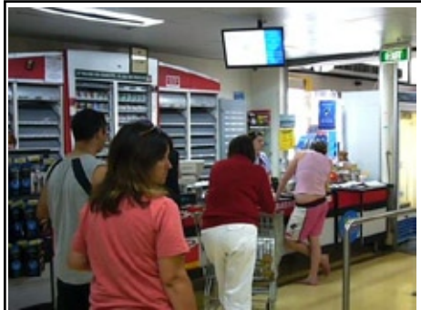
Cornetts IGA - Bongaree, Bribie Island 5 screens - 20,000 people per week