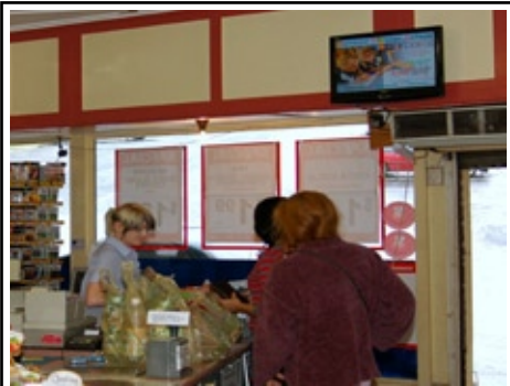
Palmwoods IGA 1 large screen - 7,000 people per week