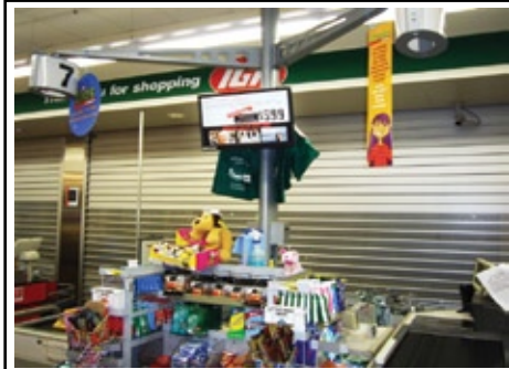
Cornetts IGA - Gympie 5 screens - 20,000 people per week